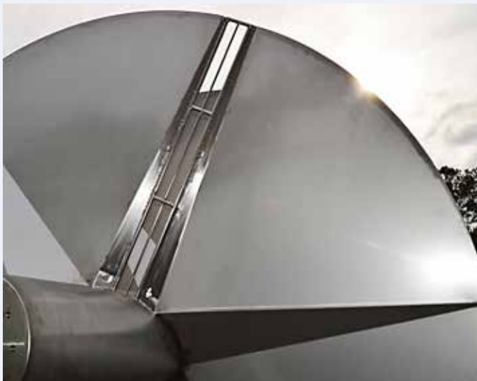
Integrated grill design allows better flow and circulation.

** MAT-12WMS lengths available in 4 foot increments