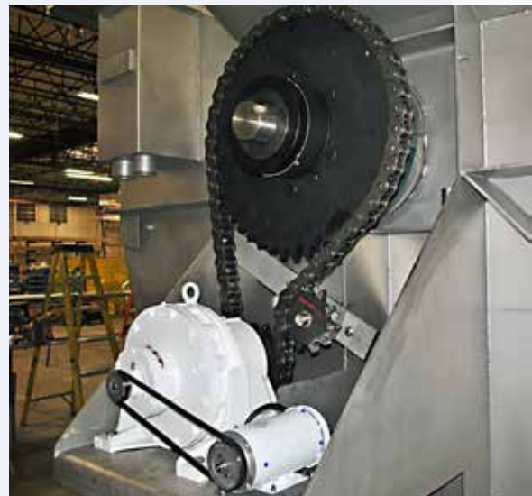
Heavy-duty drive motor, bearing chain and drive sprocket mean longer life.